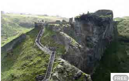
TINTAGEL CASTLE With a history stretching as far back as the Romans, and the ruins of a Medieval castle to explore, this is an ideal destination for inspirational learning.

ST MICHAELS MOUNT Discover a medieval castle and a sub-tropical paradise waiting to be explored. Your pupils can delve into the history of a fortress, a priory, a harbour and a home.