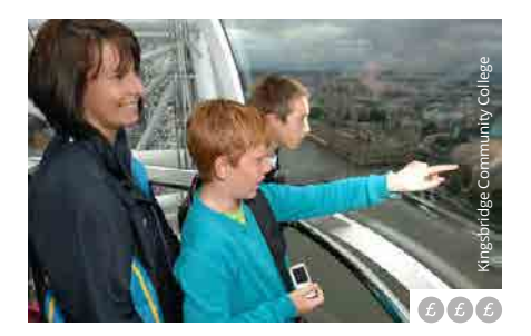
COCA-COLA LONDON EYE

Standing tall on the south bank of the River Thames, nothing says iconic like The Coca-Cola London Eye. Located right at the heart of the city, here you get closer views of London's most spectacular landmarks from Big Ben to The Houses of Parliament.