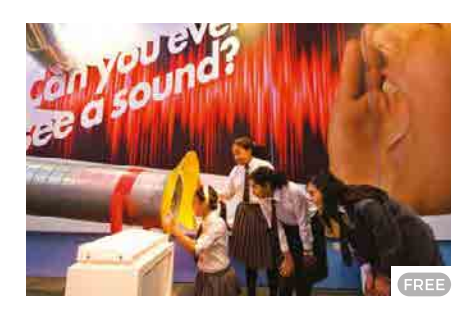
THE SCIENCE MUSEUM

The Science Museum is packed with awe-inspiring galleries, interactive resources and inspirational exhibitions. Your pupils can explore the hands-on galleries which cover a wide range of subject areas. There is also a great selection of schools events, shows and 3D films.