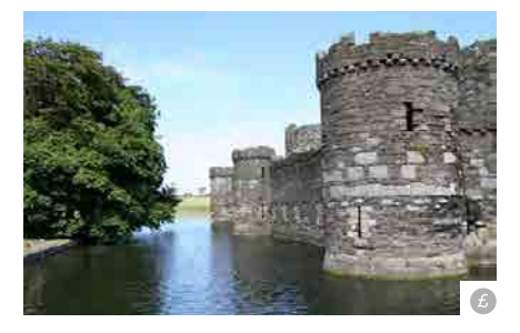
BEAUMARIS CASTLE Built by Edward I, this unfinished masterpiece is now classified as a World Heritage site.