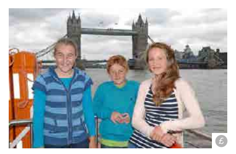
THAMES RIVER CRUISE

At this exciting museum, your pupils can explore the natural world and discover the amazing diversity of life that has evolved on our planet. Study a range of themes including climate change, evolution and the natural environment.