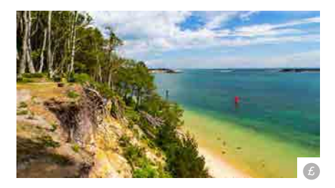
BROWNSEA ISLAND Explore the history and the flora and fauna of the island at the fascinating visitor centre.