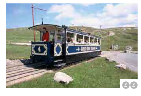
GREAT ORME TRAMWAY Take a ride on the UK's only cable operated street tramway up the Great Orme.

PRICING KEY FOR VISITS FREE Free & Under £5pp & Under £10pp & £ £ £ £10pp+